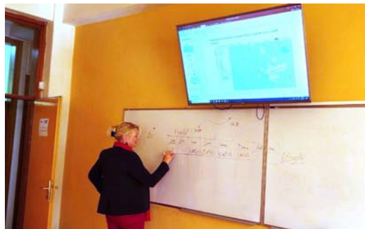
GEOBIZ LLL course, Sarajevo 2021, The first day

This LLL course offers the skills to use GIS software in a professional environment successfully.