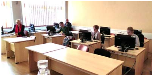
GEOBIZ LLL course, Sarajevo 2021, The third day

The LLL course participants gained a basic knowledge of SDI and the application of the QGIS program to their professional field to use that knowledge and advance their professional development.